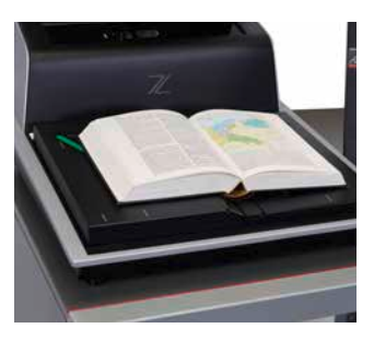
■ Book cradle OS 15000 Comfort