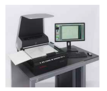
■ OS 15000 Advanced Plus: Scanning of large formats