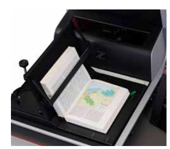
OS 15000 Comfort with book holder