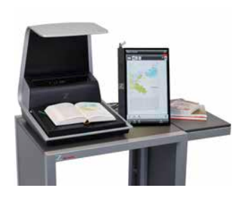
■ OS 15000 Comfort with touch panel and zeta Software