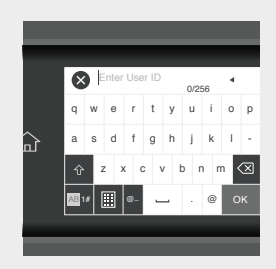
User ID & password