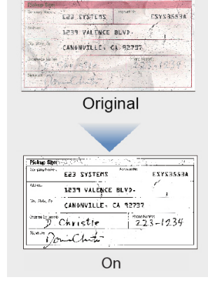
Using Active Threshold mode

Thanks to its powerful image processing features, the DR-S130 delivers consistently high-quality results. Features like autocolour detection, text orientation recognition, automatic paper size detection and deskew saves you valuable time without the need adjust settings. Using Active Threshold mode various documents, whether they have feint text or patterned backgrounds, can be scanned and processed together without the need to change any settings, saving valuable time.