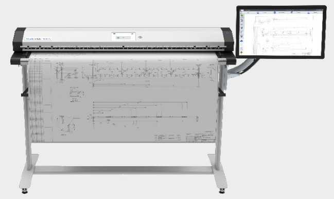
Large documents like maps rewind to the front or fall into the paper catch.

The WideTEK® 48CL produces extraordinarily sharp images, with color accuracy even superior to competing CCD scanners. Document rotation is done on the fly, a scan of an E-sized / A0 document in landscape at 300 dpi in 24bit color takes less than 7 seconds to scan and another 2 seconds to crop & deskew, preview and store