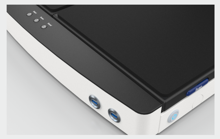
Store images directly to any USB devices via the USB 3.0 ports

Scan2Pad<sup>®</sup> wireless hotspot. Upgrade to Professional. Batch Scan Wizard Pro License. Background OCR on scanner. Full Coverage Warranty, up to 5 years of free spare parts and consumables.