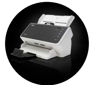
Alaris S2040/S2050/S2070 Scanners