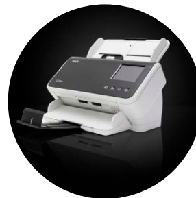
Alaris S2060w/S2080w Scanners